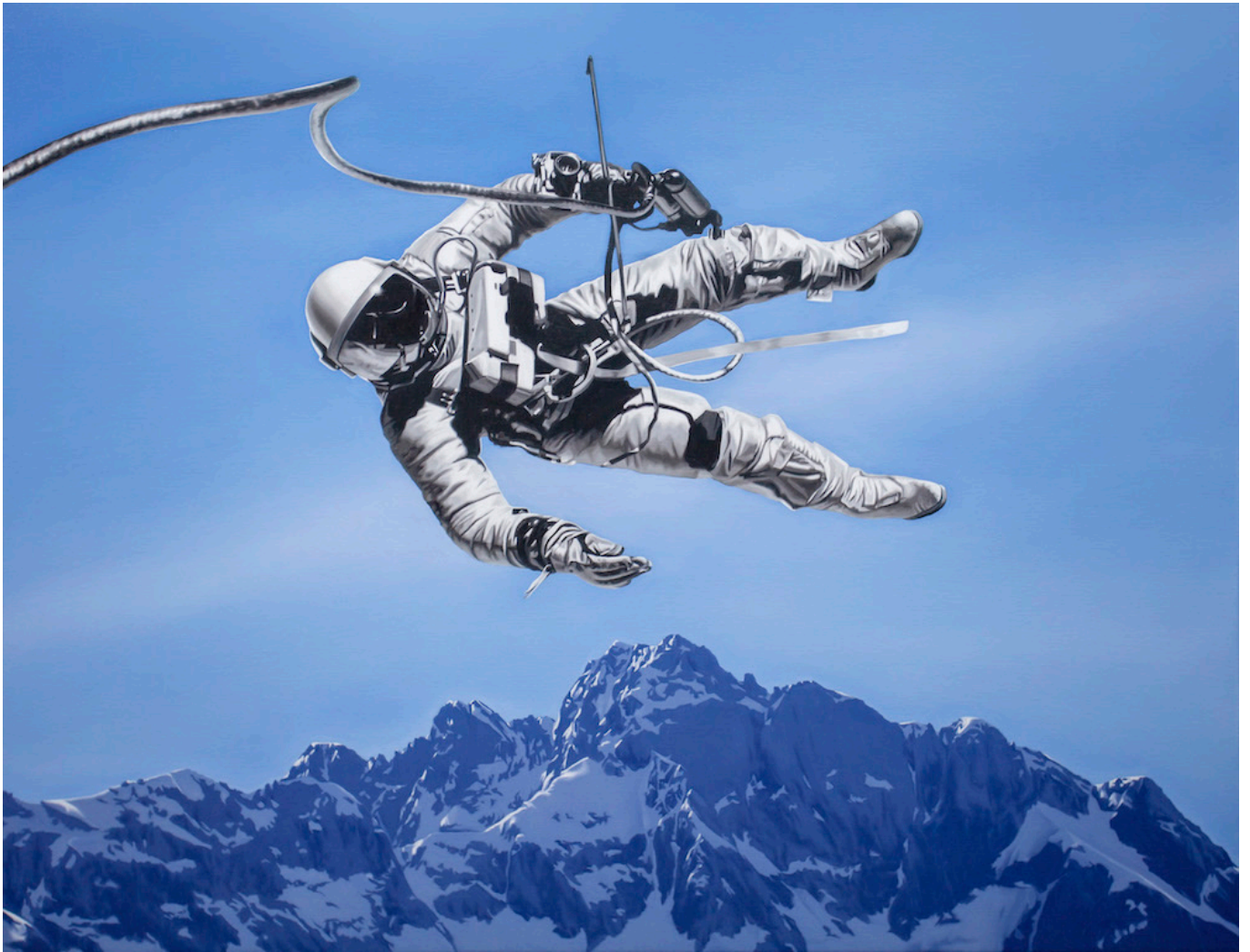
Presence 2021 oil on linen 76 x 91 cm $8,800