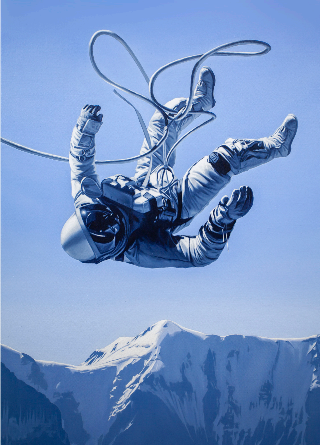
Weightless 2021 oil on linen 71 x 51 cm $7,700