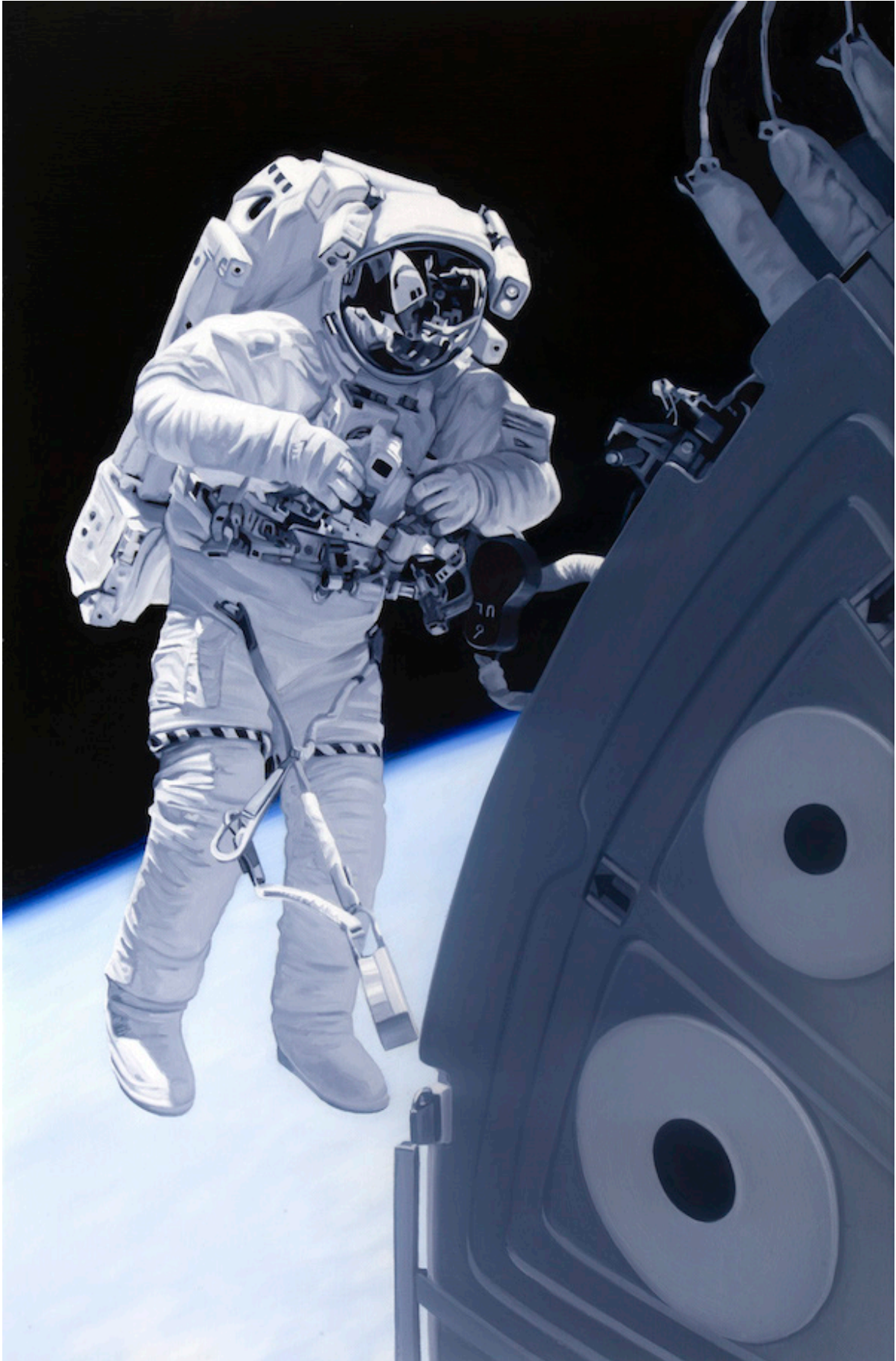
Space Station 2021 oil on linen 46 x 30 cm $4,400