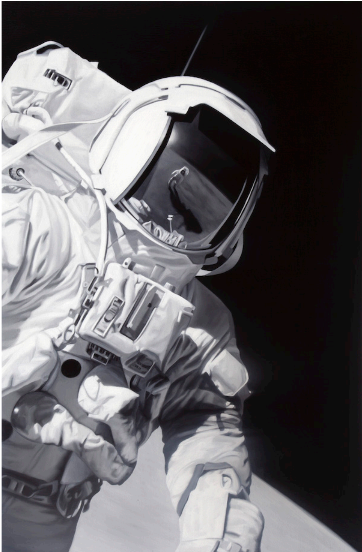
Tilt 2021 oil on linen 46 x 30 cm $4,400