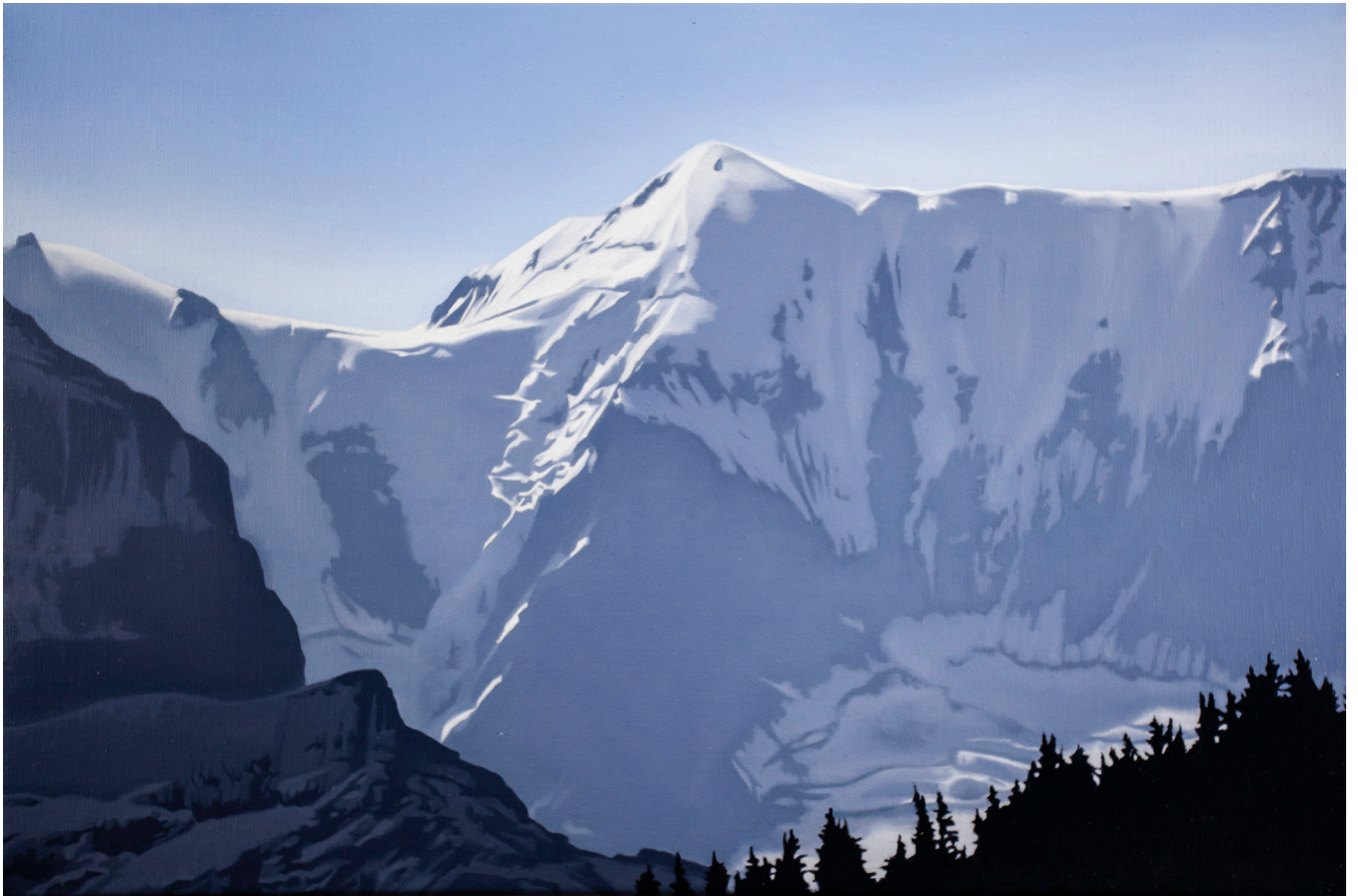
Hulfensi 2 2020 oil on linen 46 x 30 cm $4,400