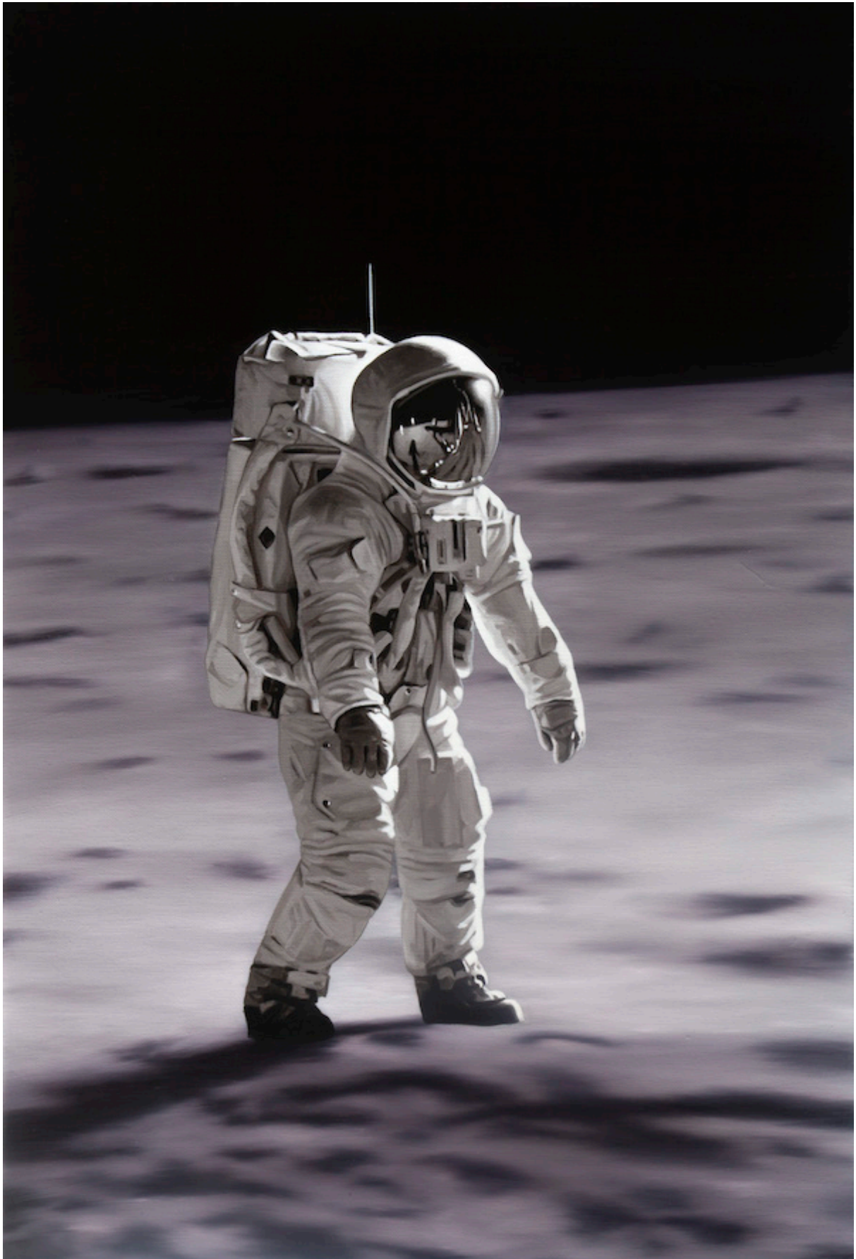
Sleepwalker 2021 oil on linen 46 x 30 cm $4,400