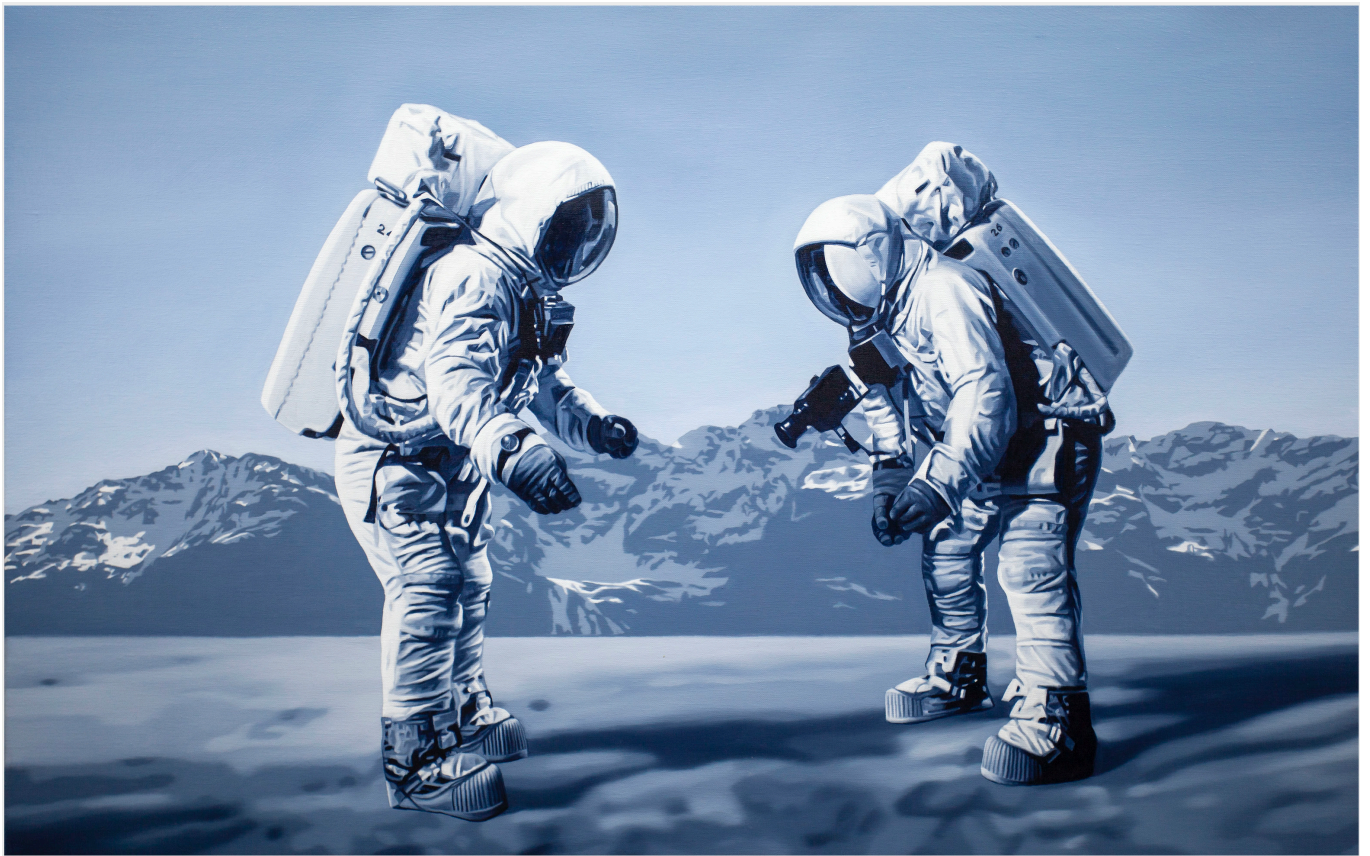
Where Are We How Did We Get Here What Should We Do 2021 oil on linen 51 x 82 cm $7,700