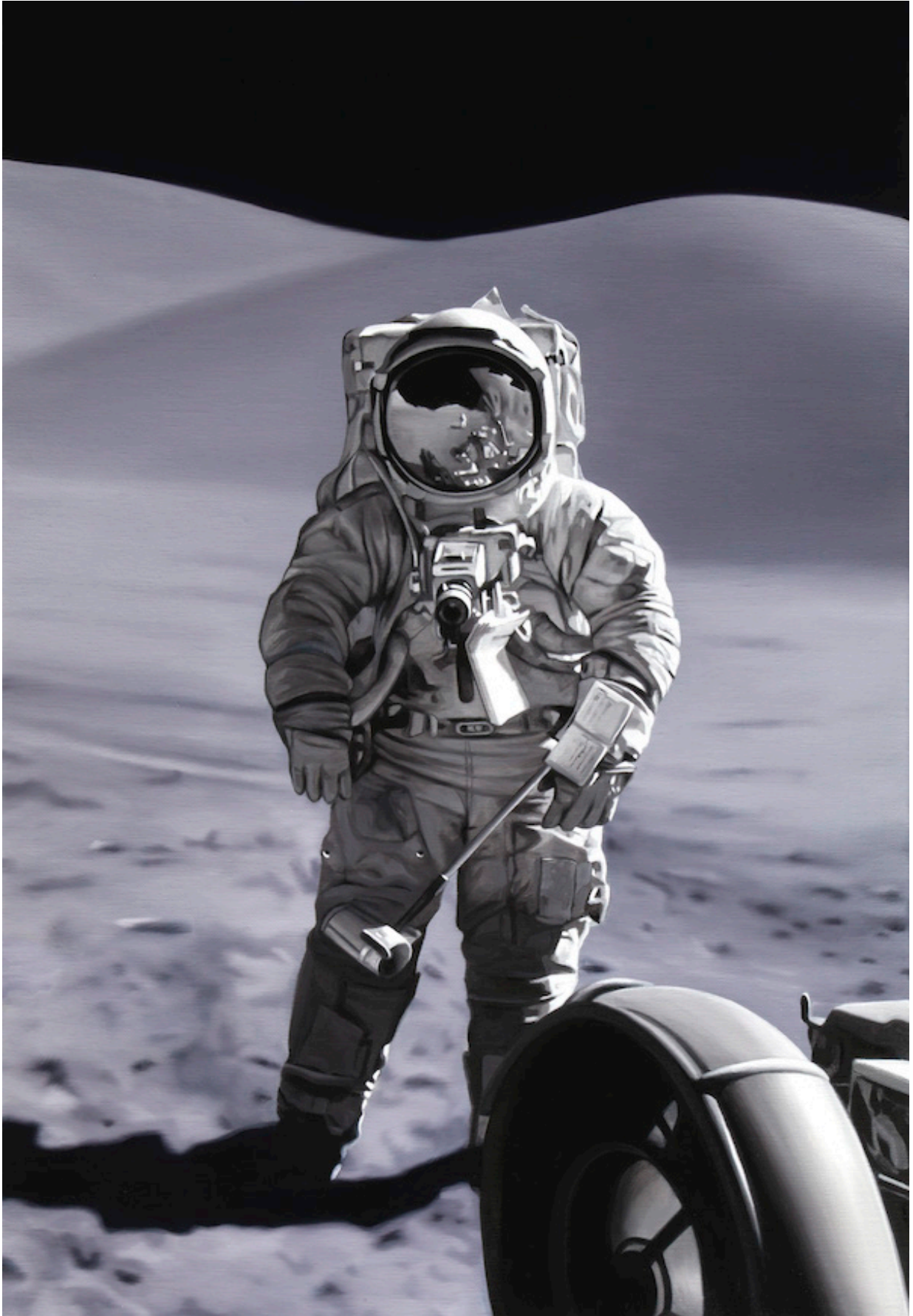
Moonside 2021 oil on linen 46 x 30 cm $4,400