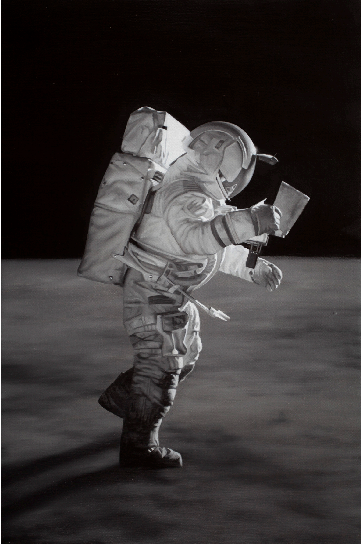
Edgar Mitchell Studying His Map II