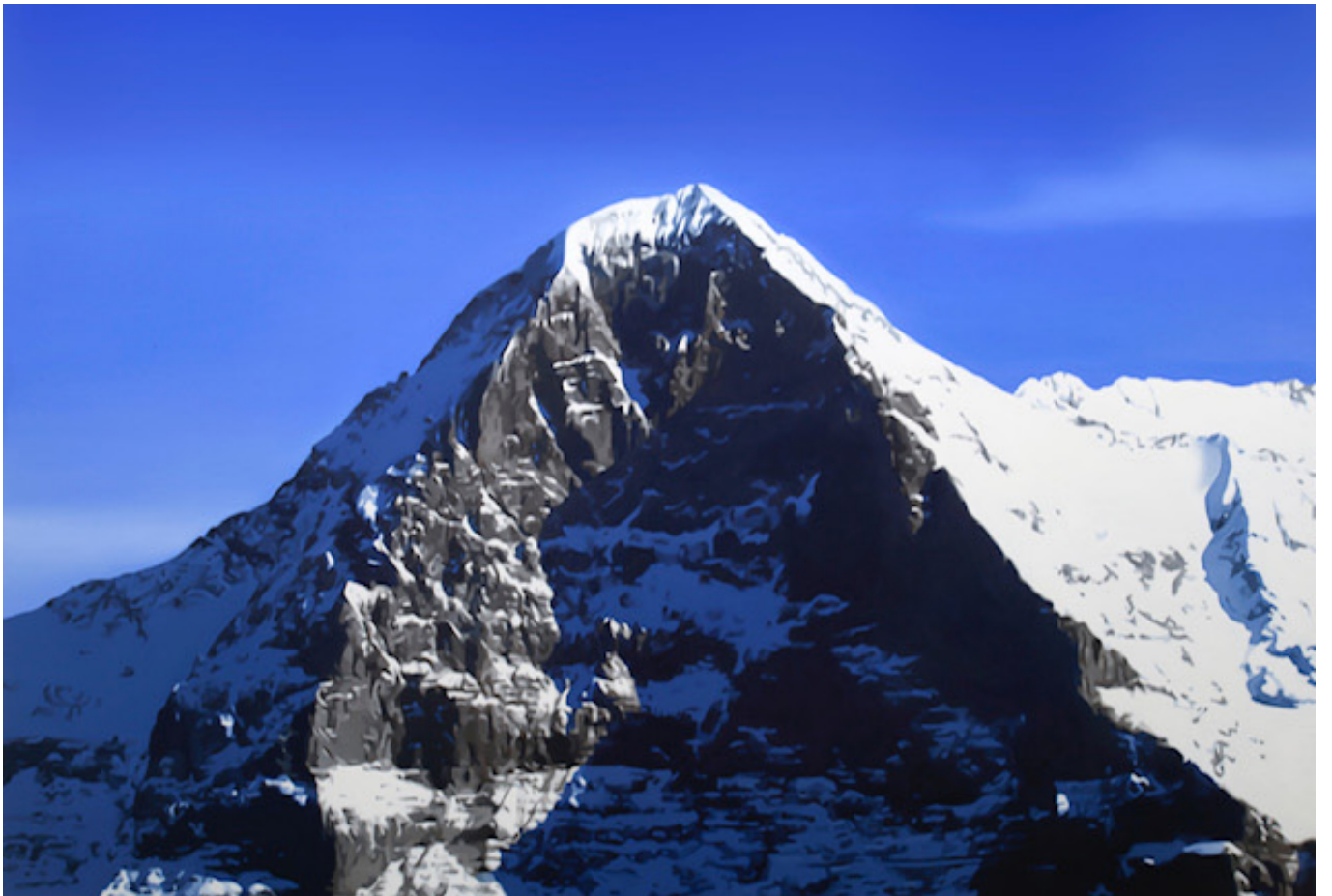
Nordwand 2021 oil on linen 102 x 153 cm $20,000