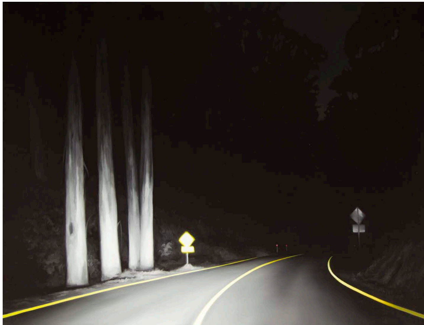
Bogong Road 2017 oil on linen 40 × 30 cm $4,000