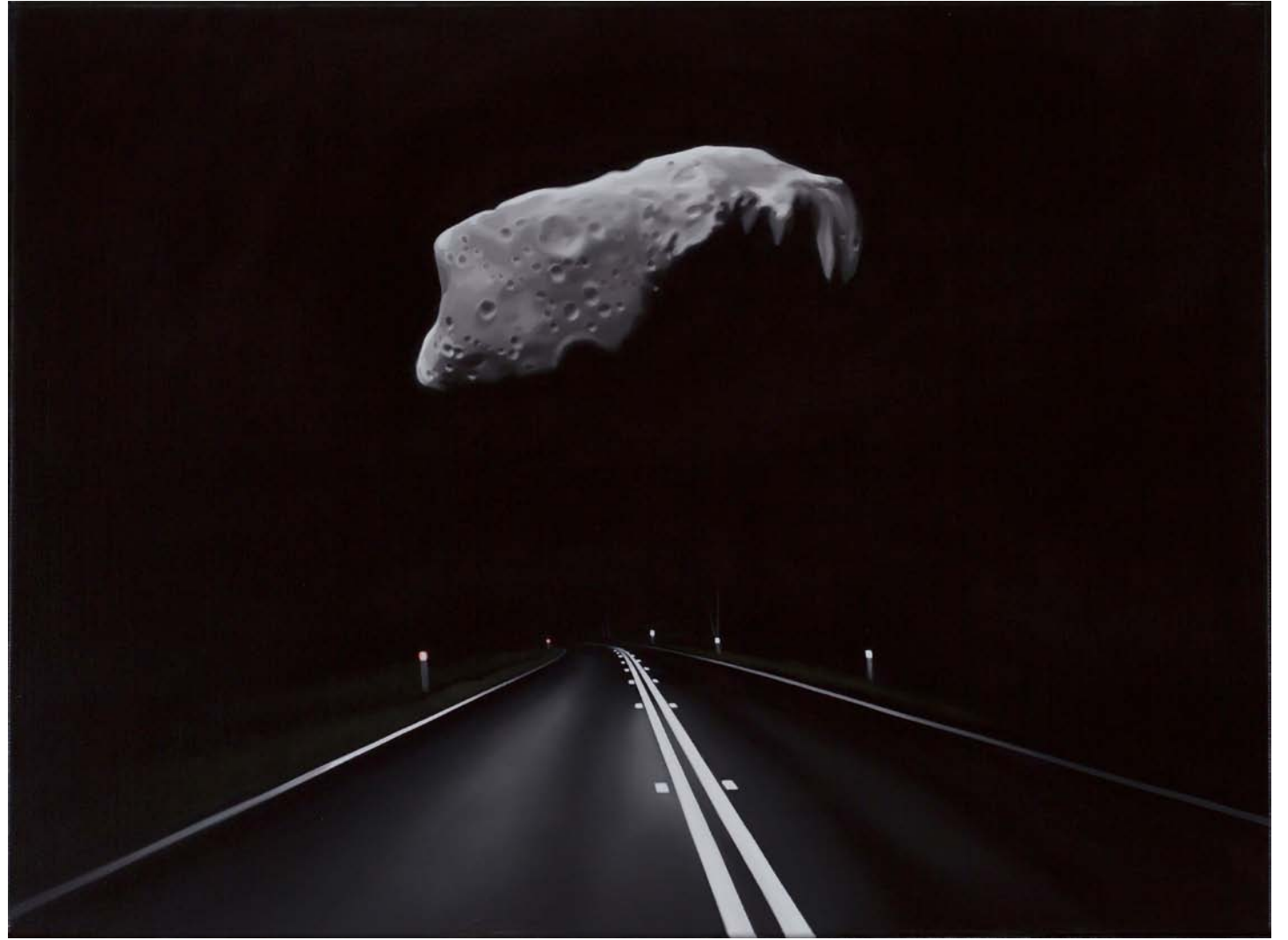
Near Earth asteroid with highway (Ida) 2017 oil on linen 45 × 61 cm $4,000