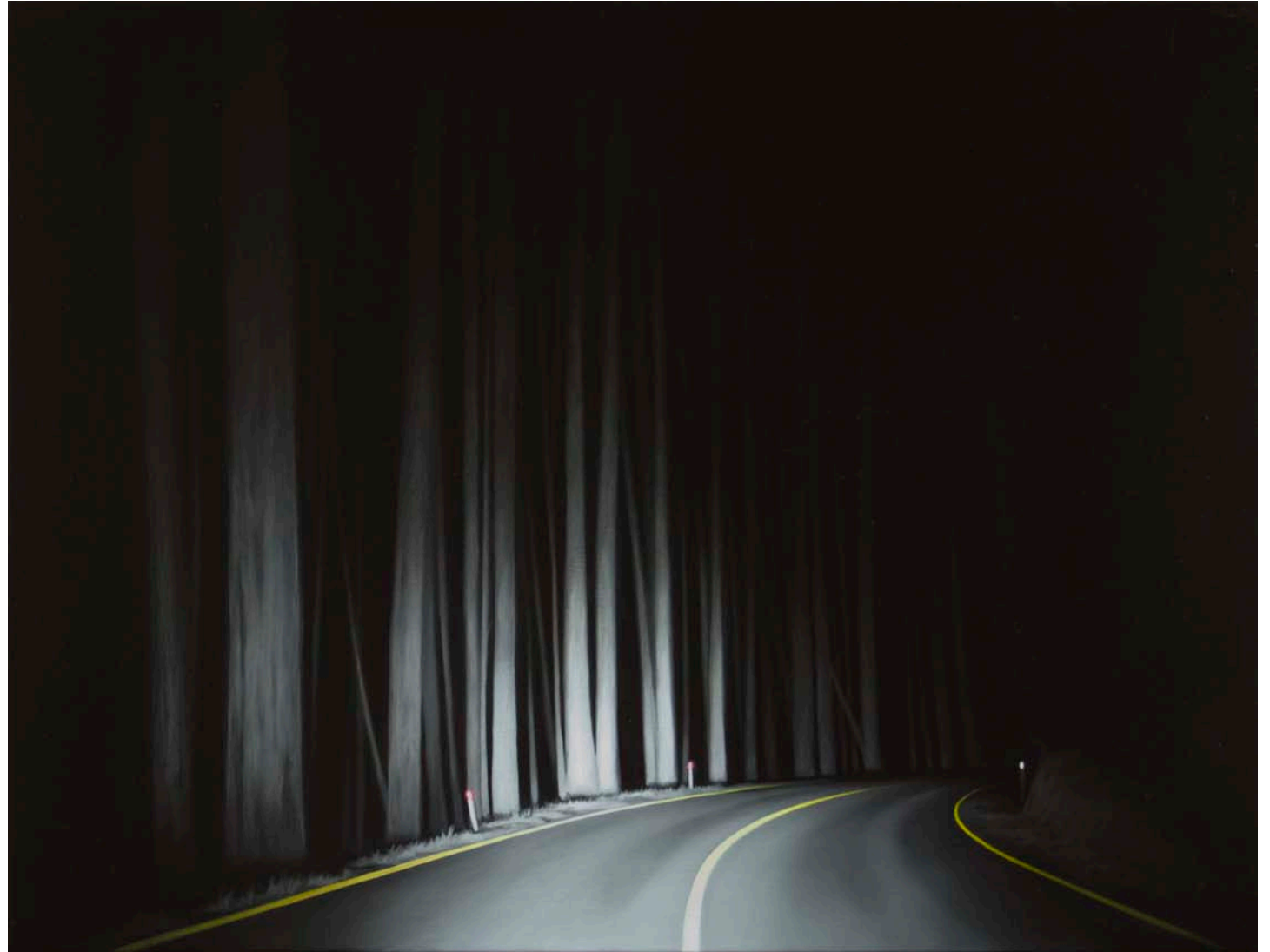
High Plains Road 2017 oil on linen 40 × 30 cm $4,000 SOLD